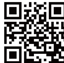
Official QR code

all has its domestic sales amount coming out at the top and some products have ready sale in Southeast Asia. Its products can be found in all the domestic markets in China and also are sold abroad.